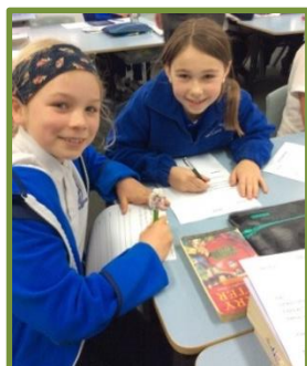
Students practicing for "Write A Book In A Day"