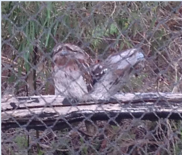
Tawny Frog Mouth

To find out more about VacSwim and to enrol online please visit education.wa.edu.au/swimming .